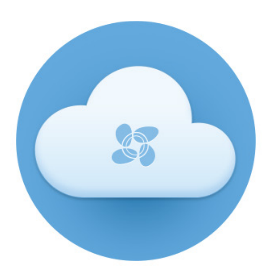
Encrypted Cloud Storage