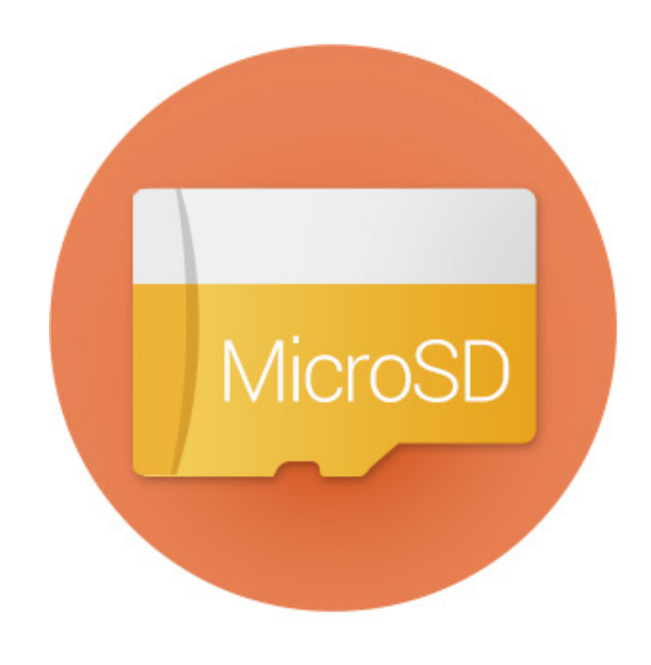
Supports MicroSD Card

Save your recordings with flexible and secured solutions. The C3A comes with a built-in MicroSD card slot that can store up to 128 GB of recorded footage. You can also save your images to EZVIZ Cloud for additional back-up (The EZVIZ CloudPlay is only available in the US, UK and Europe.)